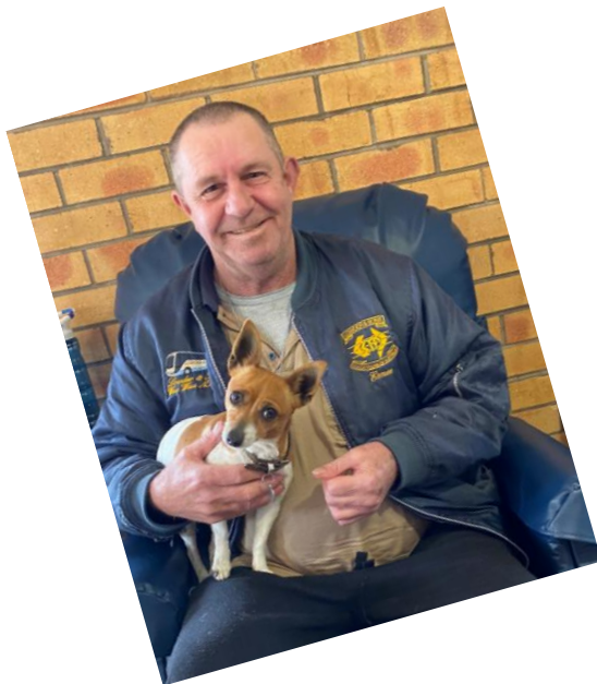
Spending time with our pets