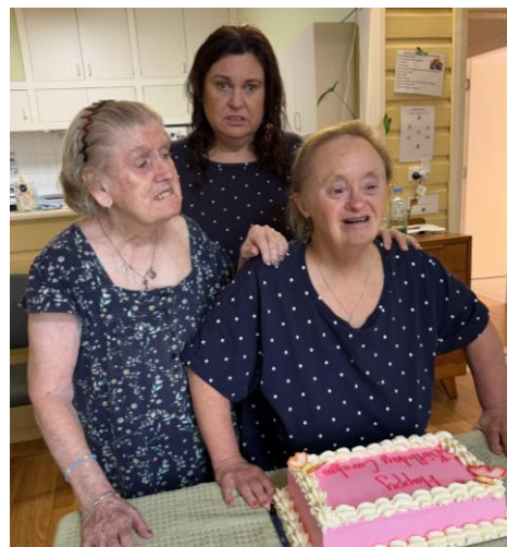
Enjoying birthdays with friends